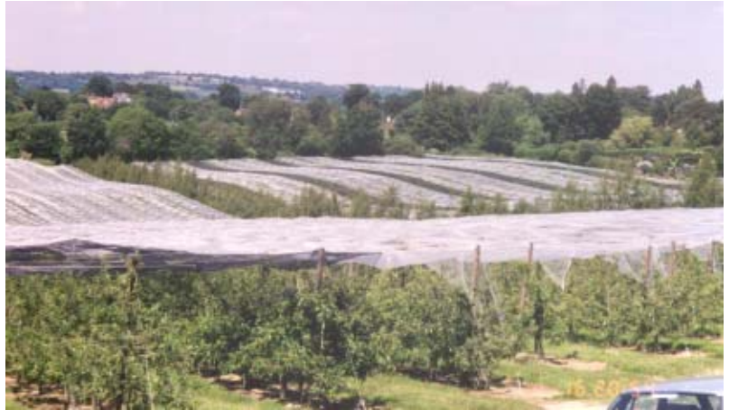
Tenax Anti-hail Net

Manufactured from high-density polyethylene in widths up to 6m, Anti-hail Net is available in either black or white and is UV stabilised, rot-proof and chemical resistant.